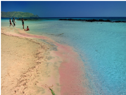
Elafonisi Beach, Pink Sand, Chania